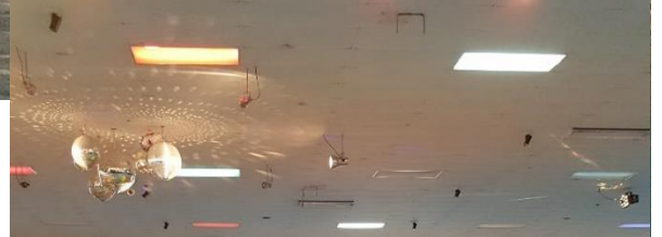
Third graders had a fabulous Christmas Party at Rollerama!